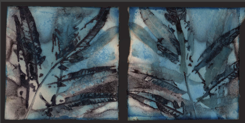
Jess Bressler, Rain Room (diptych) Eco print on watercolor paper, 4" x 8"

Woodcut / woodblock - A relief printing technique using carved wood blocks as the printing plate. The ink is rolled onto the raised surfaces of a carved block and paper is placed on top. The ink transfers to the paper. See "relief print".